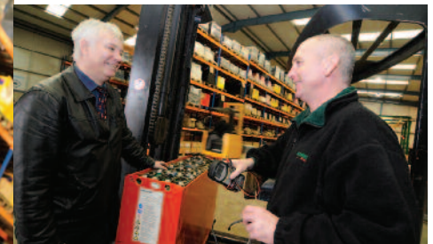
Keeping close to the customer